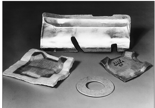
Press-formed parts made from Fiberfrax Duraset felt.

*For availability of nonstandard sizes, contact our Customer Service Department at 716-278-3800.