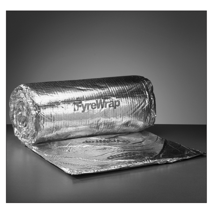
FyreWrap 0.5 Plenum Insulation

Refer to the product Material Safety Data Sheet (MSDS) No. M0200 for recommended work practices and other product safety information.